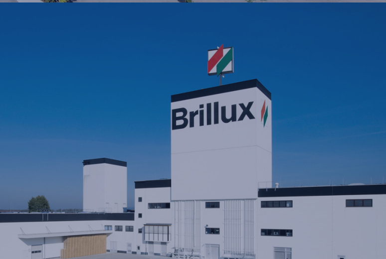
Brillux Locations: above: Factory Herford below: Factory Malsch